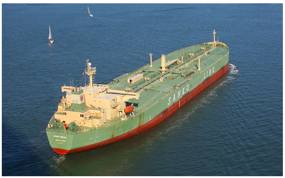
Figure 9.3 This supertanker transports a huge mass of oil; as a consequence, it takes a long time for a force to change its (comparatively small) velocity.