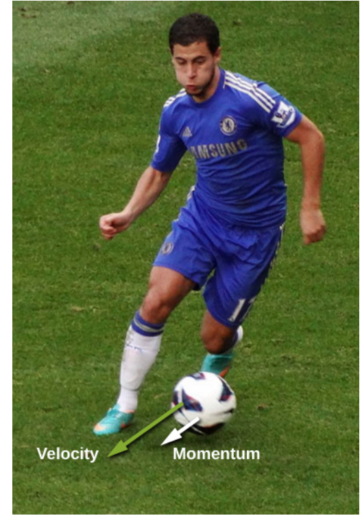
Figure 9.2 The velocity and momentum vectors for the ball are in the same direction. The mass of the ball is about 0.5 kg, so the momentum vector is about half the length of the velocity vector because momentum is velocity time mass. (credit: modification of work by Ben Sutherland)

As shown in Figure 9.2 , momentum is a vector quantity (since velocity is). This is one of the things that makes momentum useful and not a duplication of kinetic energy. It is perhaps most useful when determining whether an object's motion is